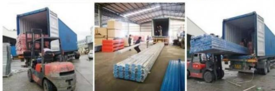
Loading for Beam