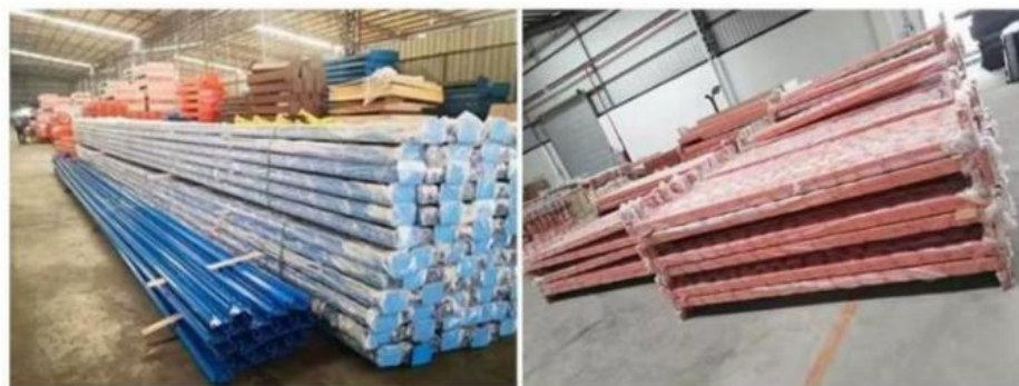
Package for Upright Frame