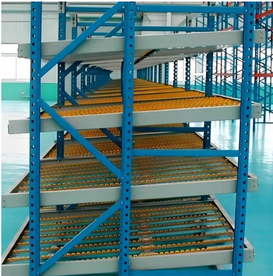
Packaging & Shipping