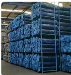
fabric roll storage